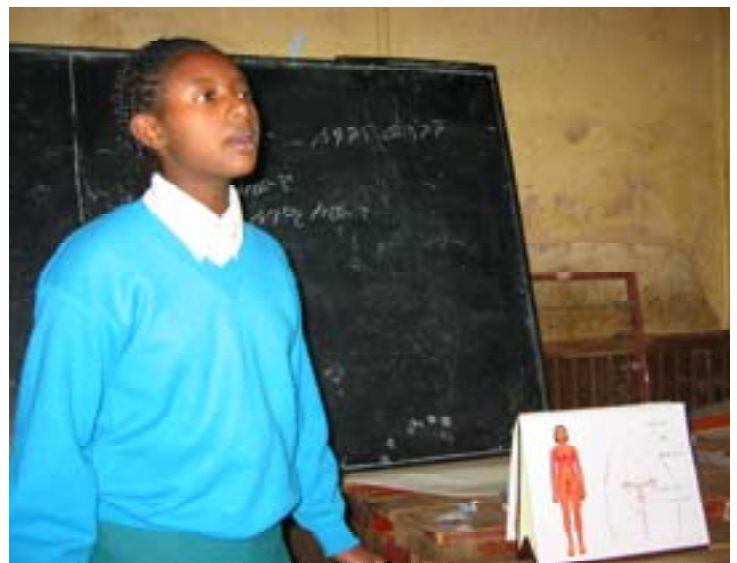
Save the Children- trained peer educator in front of classroom

CORHA receives financial assistance from USAID through Pathfinder (for institutional strengthening) and FHI (for research and monitoring/evaluation). The Packard Foundation also provides assistance to CORHA for its advocacy work.