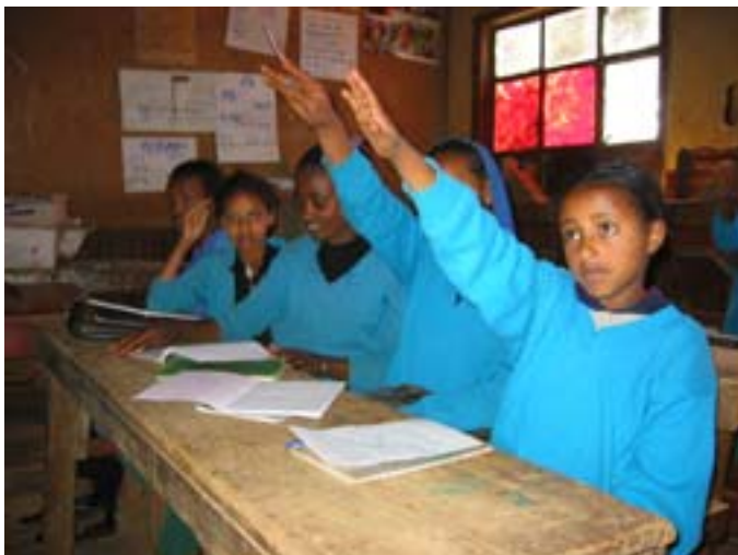
School attendance is a protective factor for reproductive health, yet less than a quarter of school-age girls in rural areas attend school.

A large majority of youth have heard about AIDS and the most common source for AIDS information is community meetings, followed by schools/teachers, radio, and friends/relatives. Knowledge of key prevention behaviors to avoid HIV/AIDS (abstinence, partner reduction, or use of condoms) is more common among young men than young women with only four out of 10 women 15-19 able to name at least two key prevention behaviors. Currently, testing for AIDS is relatively uncommon (less than 2% of male youth have been tested), but a majority report that they would like to be tested, suggesting the potential for expanded use of voluntary counseling and testing (VCT) activities.