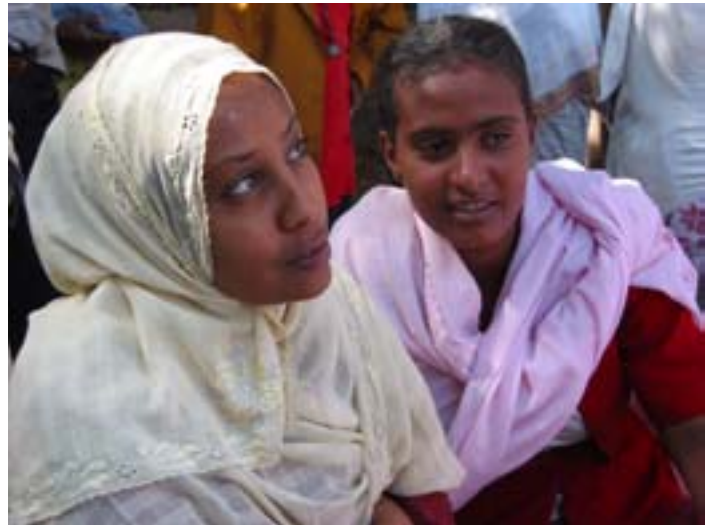
Young women in Ethiopia tend to marry early, marry older men and not use contraception.

Another underlying problem that negatively impacts reproductive health and retards overall development is pervasive gender inequality. The low status of women and girls and lack of male participation in family planning and AIDS prevention activities makes it especially difficult for reproductive health programs to achieve success. Societal inequalities between males and females, inequities within the family, harmful traditional practices against young girls, and the "sugar daddy" phenomenon are common in Ethiopia and are powerful forces that impede efforts to educate young women and men about reproductive health and provide them with needed services.