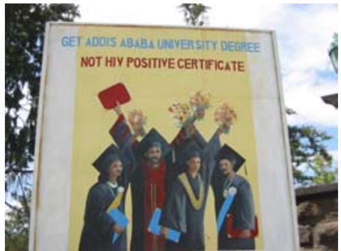
Sign outside Addis Ababa University

In one of the few studies to measure HIV seroprevalence among men from predominantly rural areas, over 71,000 army recruits were tested during 1999 and 2000 and prevalence was found to be 3.8%. 9 Prevalence rose with age, and was also higher among urban recruits. Prevalence was also higher among Orthodox Christians than Muslim recruits.