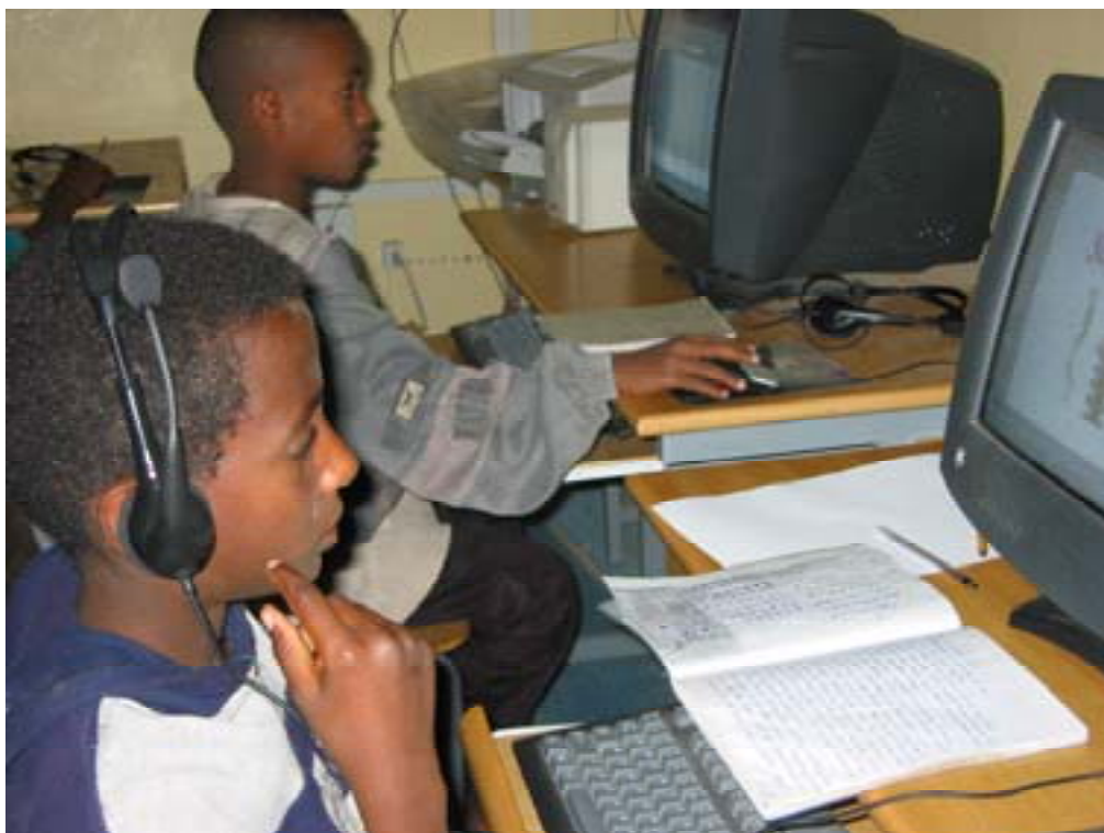
Computer-assisted learning for at-risk youth at OIC Center

More detailed information about the services provided by each of these organizations, as well as information about other organizations visited that provide support or funding for youth reproductive health programs, can be found in Annex 5. A brief summary of the types of existing programs and policy initiatives that support youth reproductive health, as well as the donors that fund them, follows.