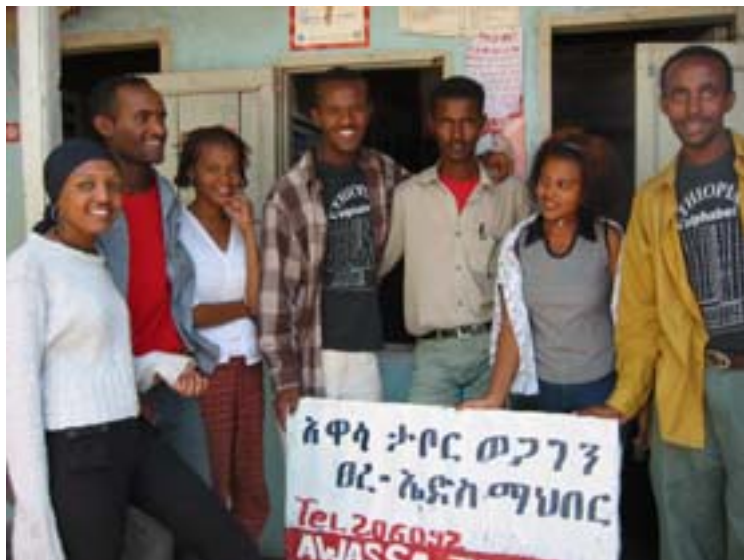
OSSA affiliated Anti-AIDS club members in Awassa

NGOs, both international and Ethiopian, are at the forefront of adolescent reproductive health programs in Ethiopia and were the subject of the majority of the team's visits, interviews, and observations during our time in-country. The team's assignment consisted of assessing youth reproductive health programs supported by USAID/Ethiopia and the Packard Foundation in three regions of the country. The NGOs supported by USAID/Ethiopia that were visited by the