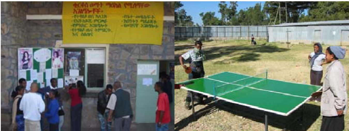
FGAE Youth Center in Addis Ababa

The NGOs supported by USAID/Ethiopia and the Packard Foundation are all members of a consortium known as CORHA – the Consortium of Reproductive Health Associations.